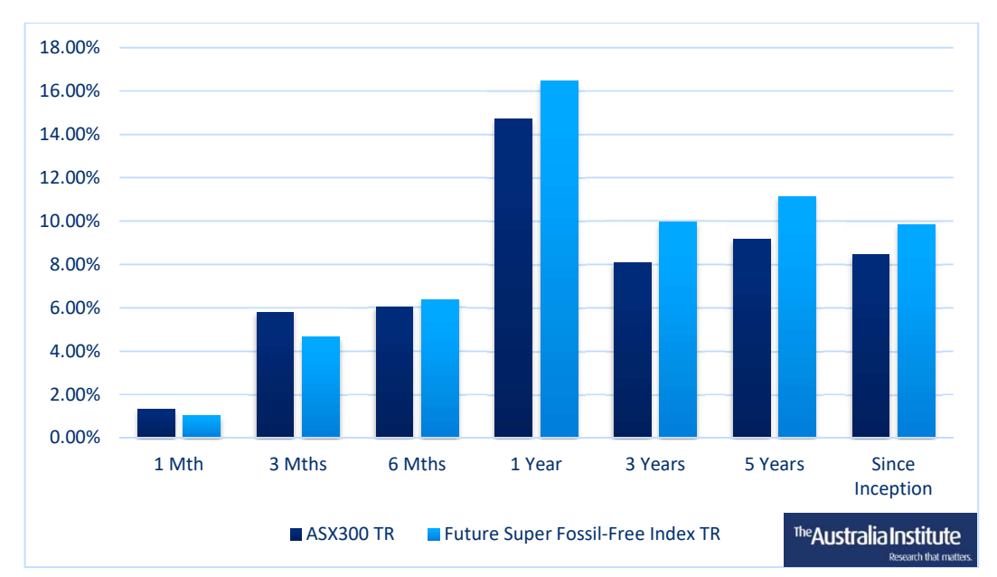
Figure 2: Local comparison – Standard vs Fossil Free Index